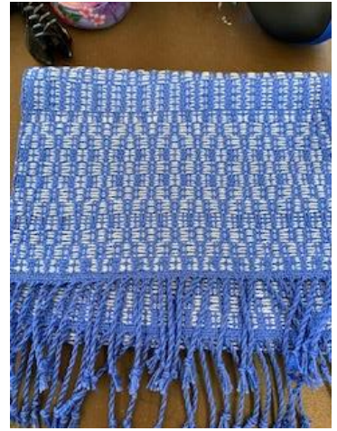
Ann Wingate's samples from the Block Party Workshop and a Monk's Belt table runner.