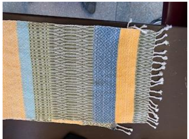
Molly Barnes' samples from the Block Party Workshop using various overshot drafts.