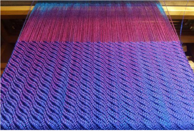
Second moebius scarf on the loom (same warp).