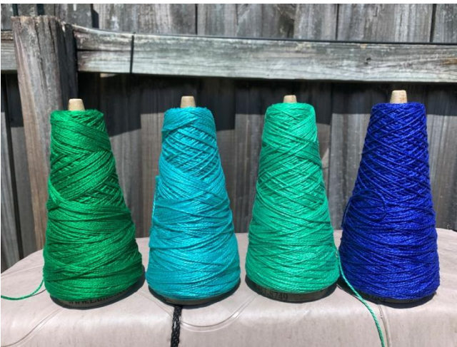
These are the four colors to work with. Yarn is 3/2 Cotton