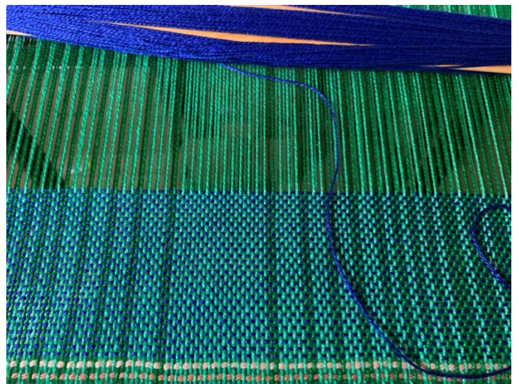
Warp-10 Green and Sea Green/Weft-Cobalt Linear Gradient Towel 1