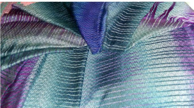
This is yardage that was woven with no purpose yet.

Rudell Kopp sent these pictures in of what she's been working on lately.