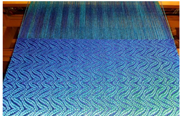
A mobius scarf on her loom...beautiful colors!