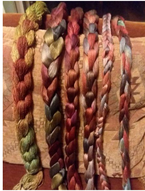
Warps for infinity scarves (in the planning stages)...beautiful fall colors.