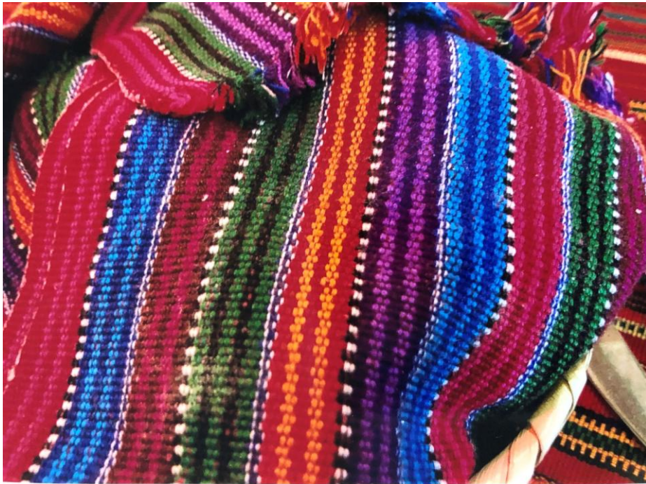
(Inspiration from Guatemala trip.)